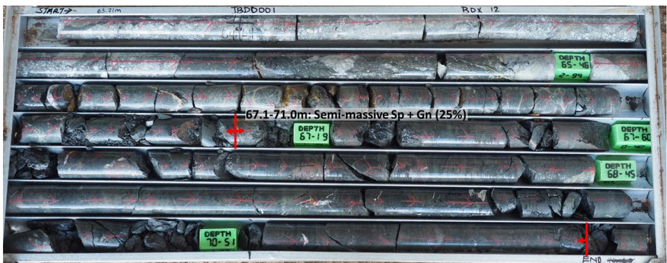
Figure 1. JBDD001 Semi-massive sulphide intersection containing approx. 25% total sulphides (sphalerite + galena), based on visual estimation of sulphide in ore.

Drill hole JBDD001 was positioned as a twin hole to the historical hole J017, drilled by Messina Transvaal Development Co. Ltd (refer to ASX announcement released on 5 December 2017). Host stratigraphy (limestone and calc-silicate) was intersected between 56.5 metres and 81.5 metres, with substantial semi-massive sulphides intersected between 67.1 metres to 71.0 metres and 76.1 metres to 77.82 metres, with visually identified sphalerite (zinc) and galena (lead) .