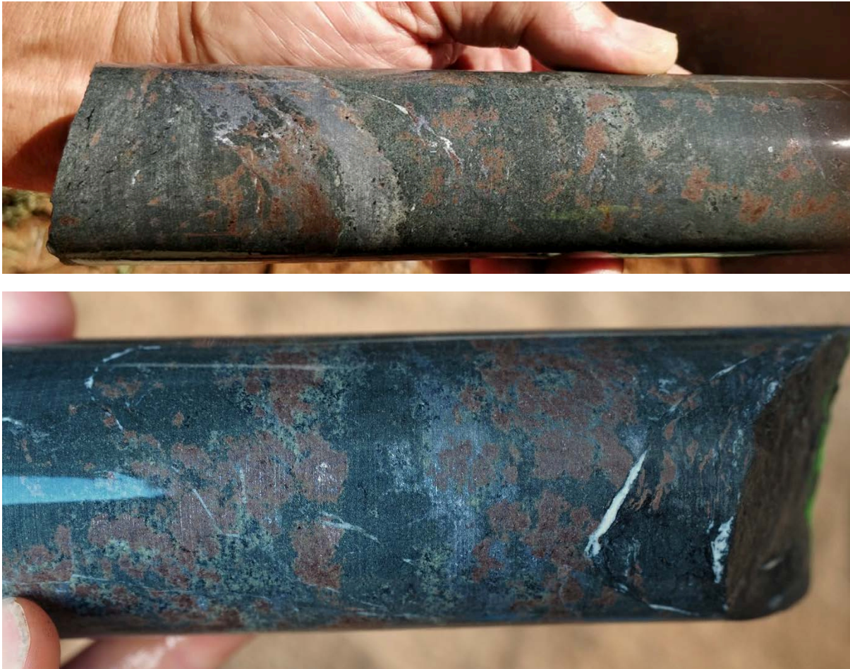
Figure 2. JBDD001 (NQ) - Semi-massive galena (grey) and sphalerite (purple) hosted in fine grained matrix.

These latest visual observations of drill core in which sphalerite and galena are the dominant sulphide minerals (refer to Figure 2) support the reported historical observations at Joubira. No exploration has been completed on either the immediate target area or surrounding area for over 16 years, and no modern exploration or assay methods have been applied.