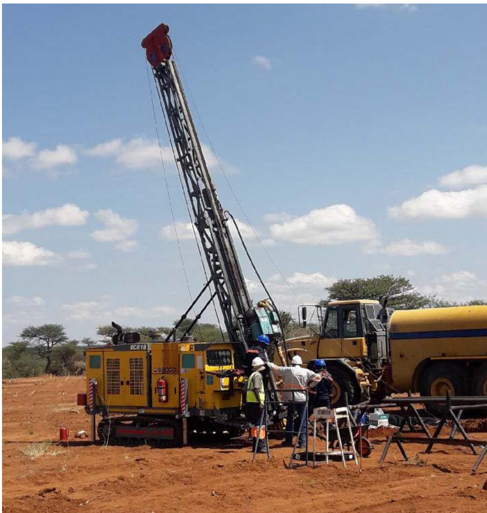
Figure 1: Diamond drilling commencing at Joubira.

For additional information on the acquisition, please refer to the ASX announcement on 5 December 2017.