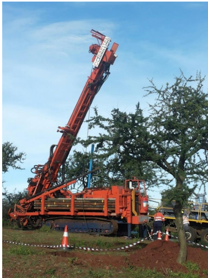
Track Mounted Multi-purpose RC/Diamond Rig at Winston